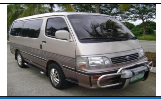
TOYOTA TOWN - 2012